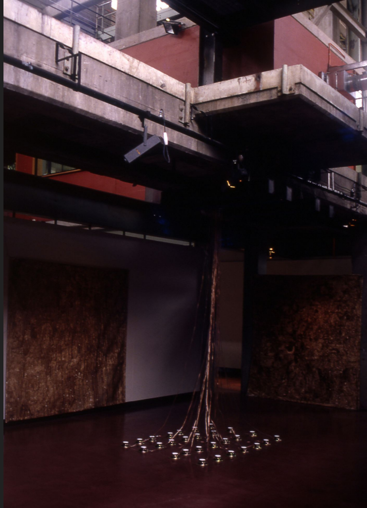
Installation view, Khaled Sabsabi, Aajyna , 1998, Casula Powerhouse Arts Centre