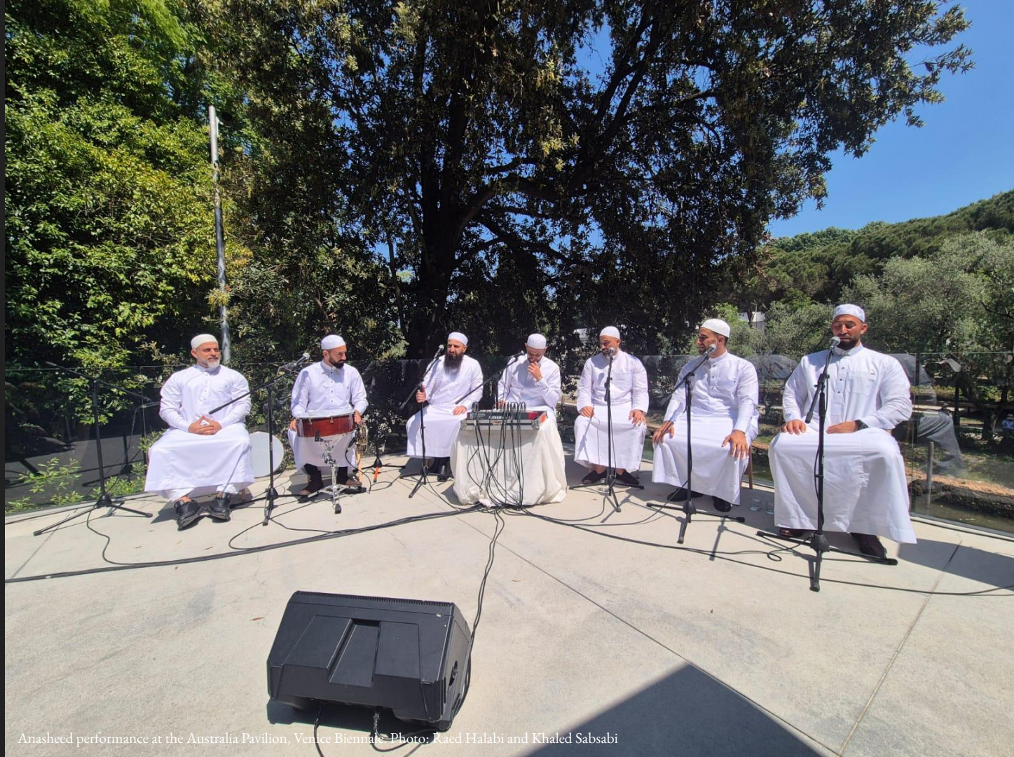
Anasheed performance at the Australia Pavilion, Venice Biennale.