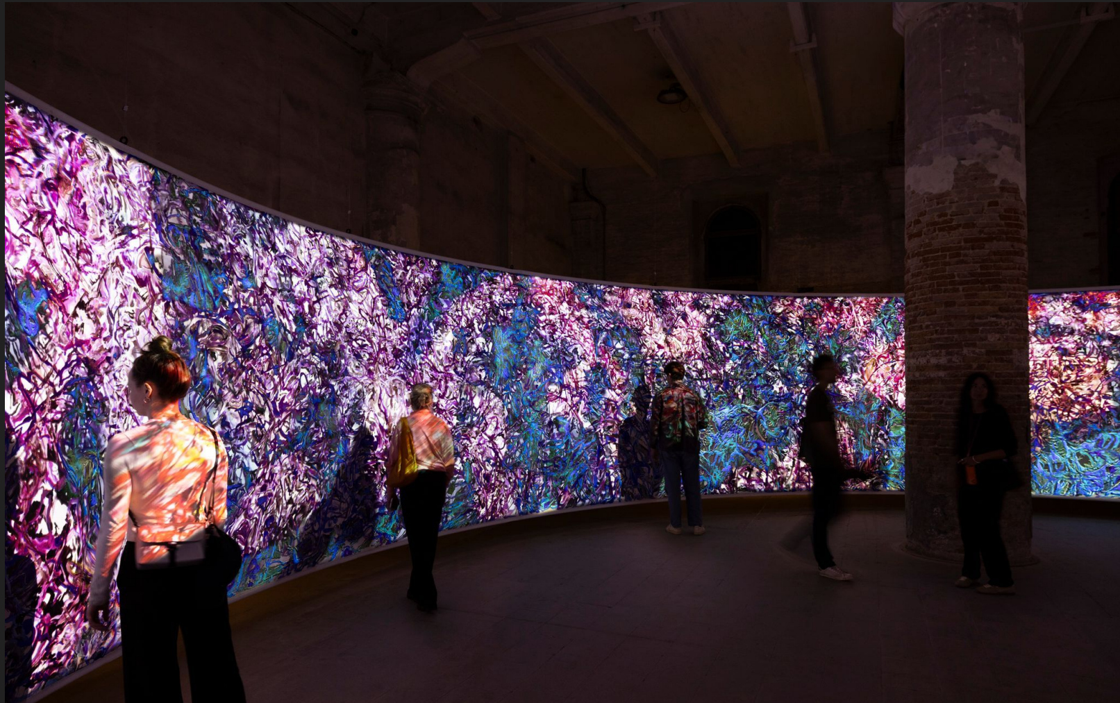
Khaled Sabsabi, khalil , 2026, 8 channel HD video installation with audio, 40 x 2.8 metre acrylic paint on canvas, steel, black oud scent, 64 minutes. Developed with Michael Dagostino.