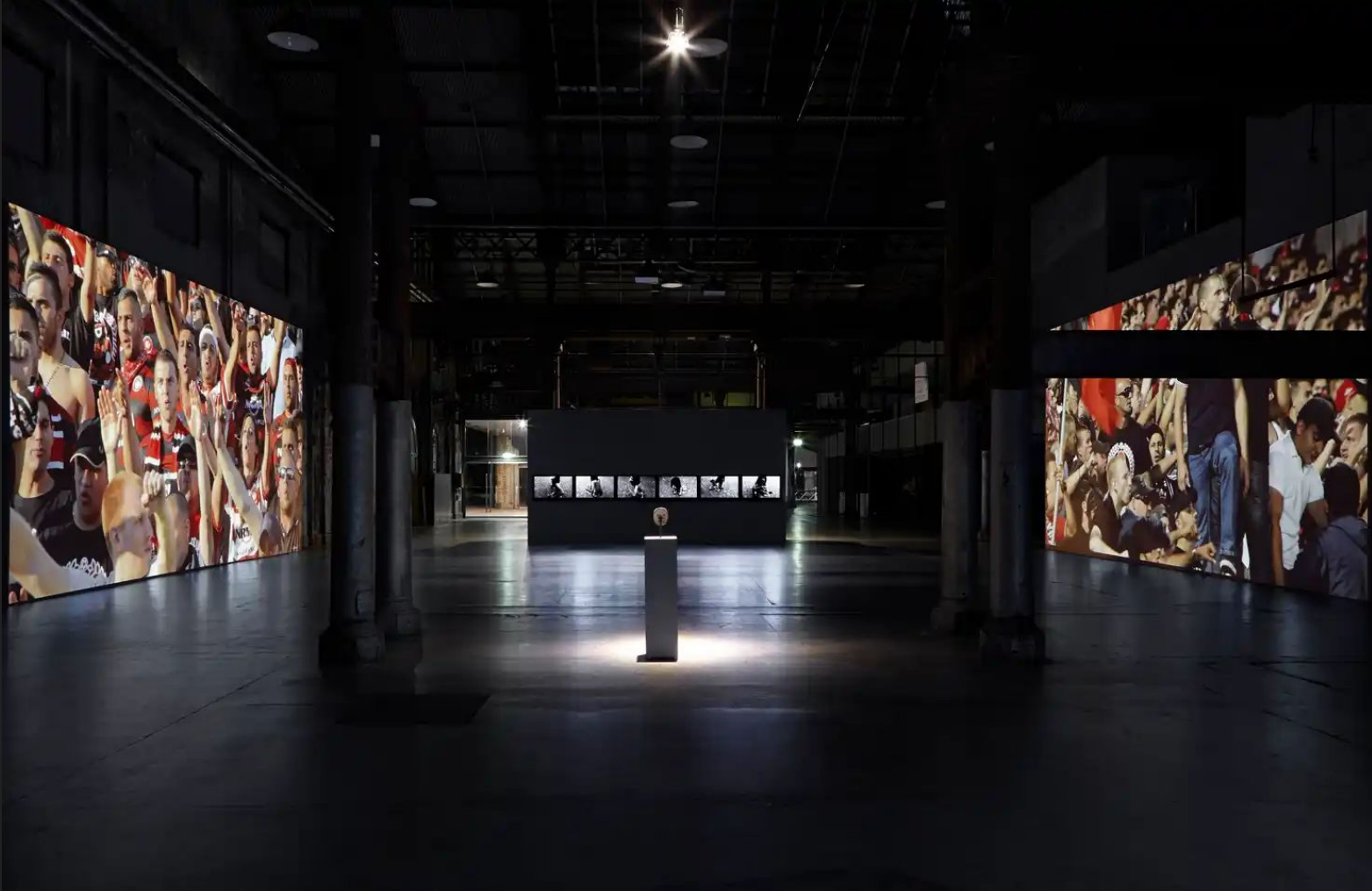
Installation view, Khaled Sabsabi, Organised confusion , 2014, Carriageworks, 2015.