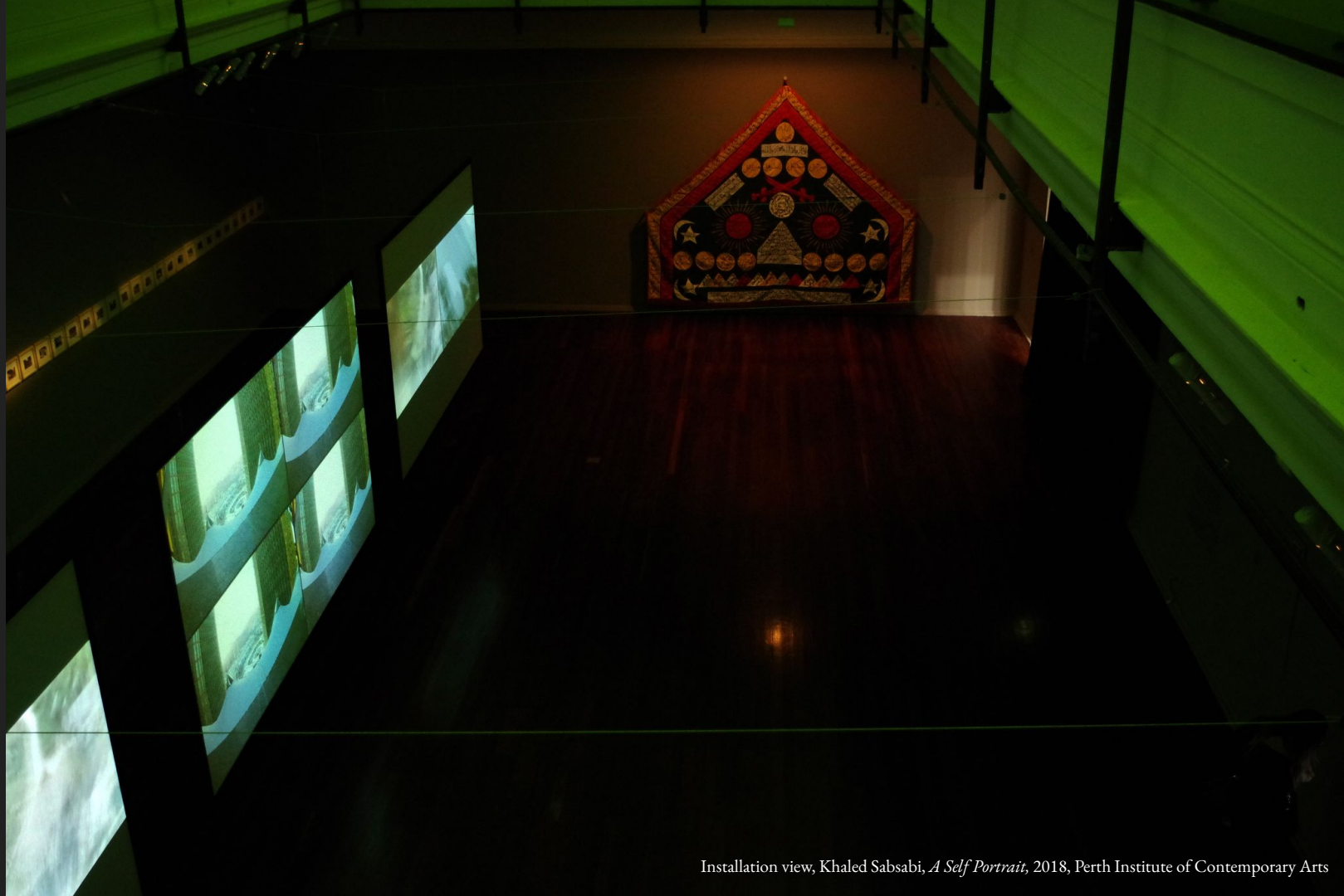
Installation view, Khaled Sabsabi, A Self Portrait , 2018, Perth Institute of Contemporary Arts