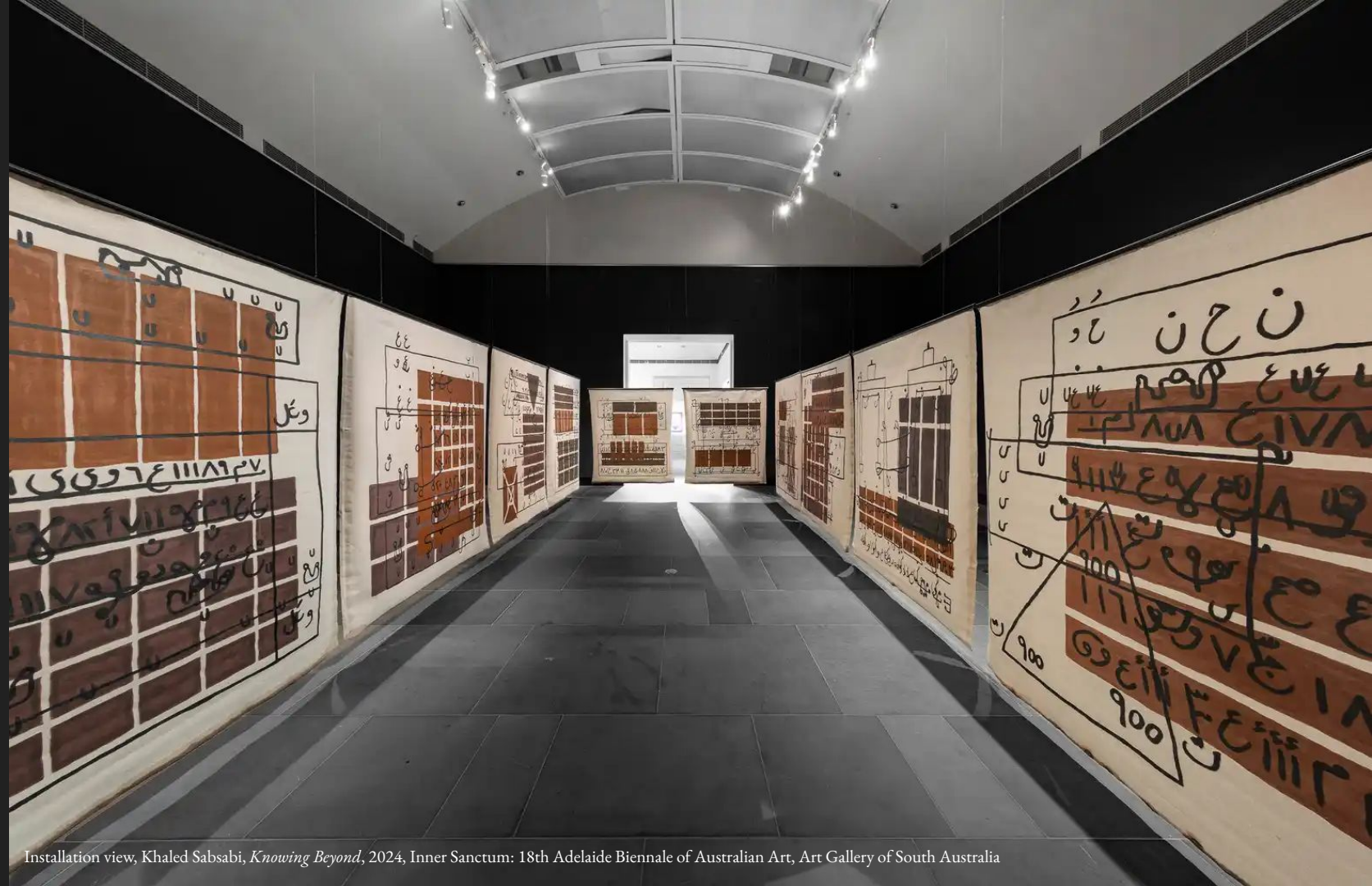
Installation view, Khaled Sabsabi, Knowing Beyond , 2024, Inner Sanctum: 18th Adelaide Biennale of Australian Art, Art Gallery of South Australia