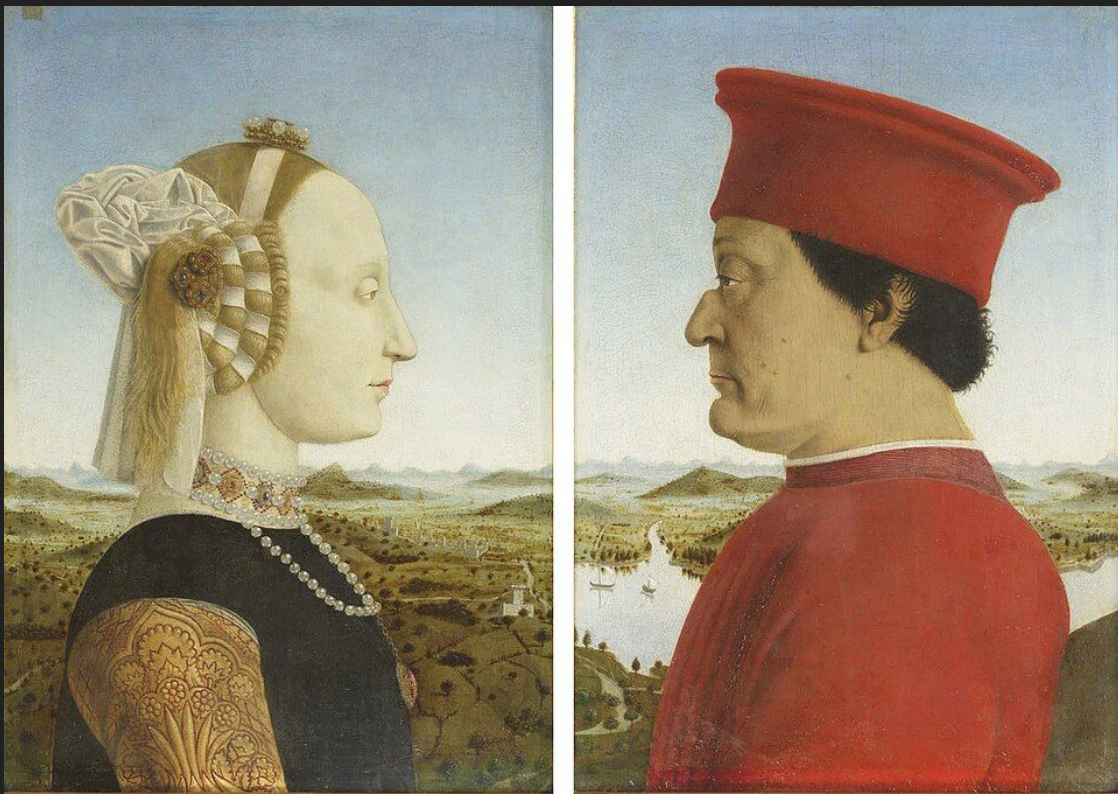
Piero della Francesca, Diptych of Federico da Montefeltro and Battista Sforza (circa 1473–1475), oil on wood