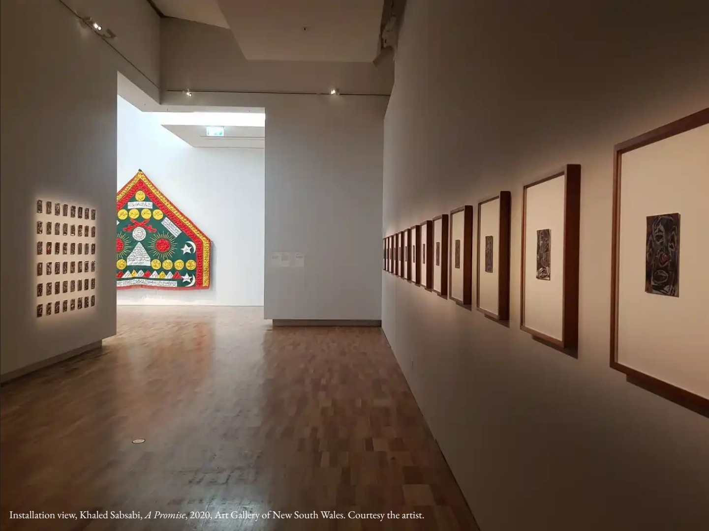
Installation view, Khaled Sabsabi, A Promise , 2020, Art Gallery of New South Wales.