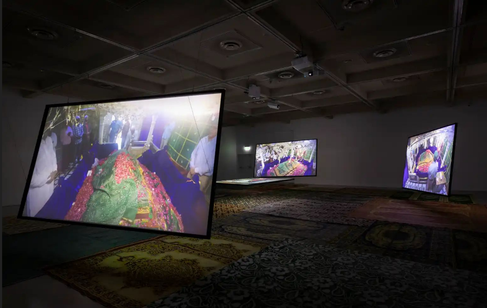
Installation view, Khaled Sabsabi, A Hope , 2022, Campbelltown Arts Centre.