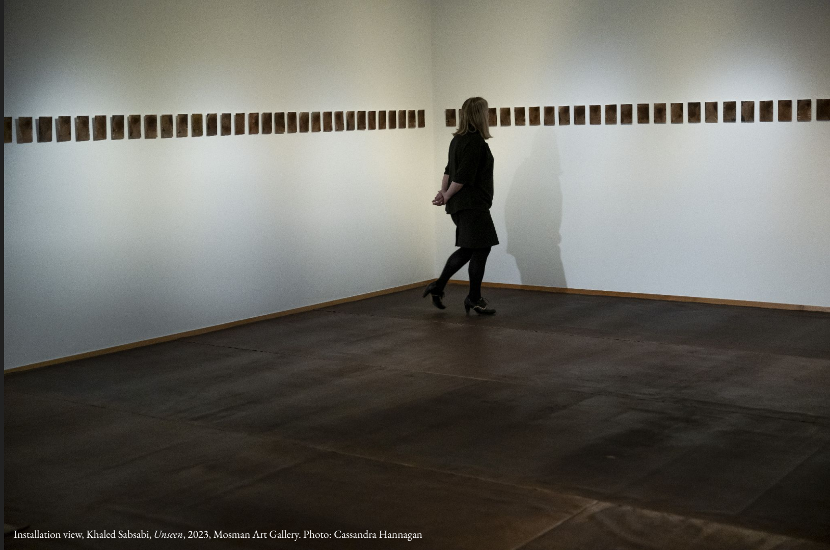
Installation view, Khaled Sabsabi, Unseen , 2023, Mosman Art Gallery.