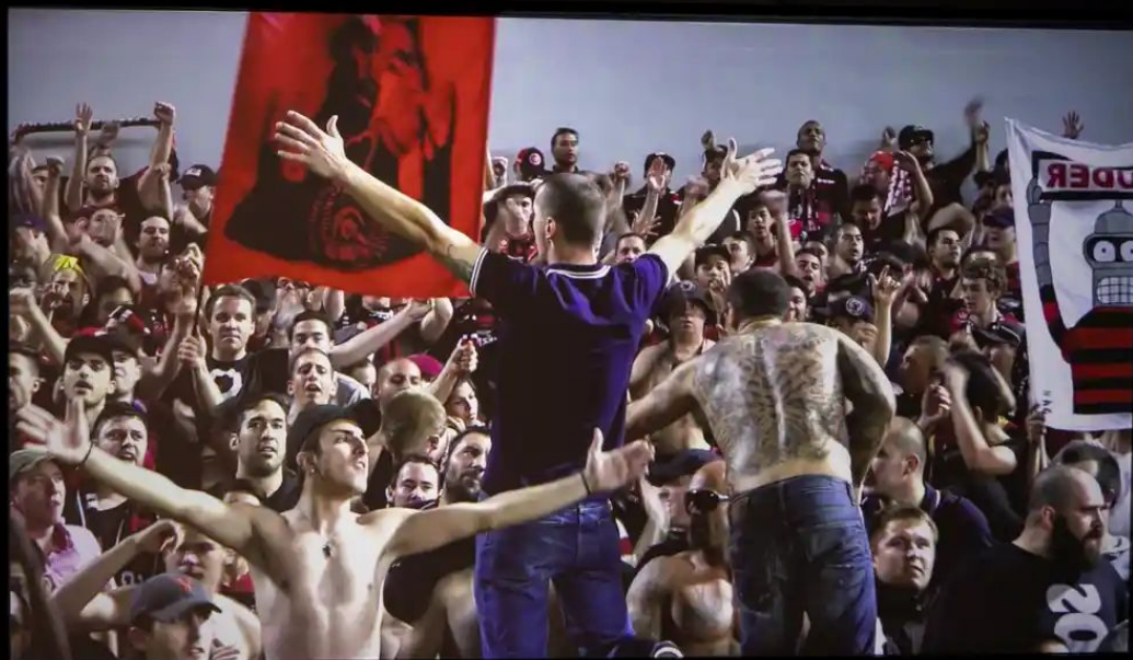
Installation view, Khaled Sabsabi, Wonderland , 2014, A Hope , Campbelltown Arts Centre, 2020.